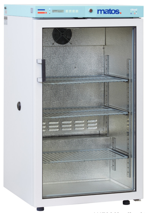
MATOS Plus Cloud 200 S/G

Cloud 200 S – Solid Door Cloud 200 S/G – Glass Door